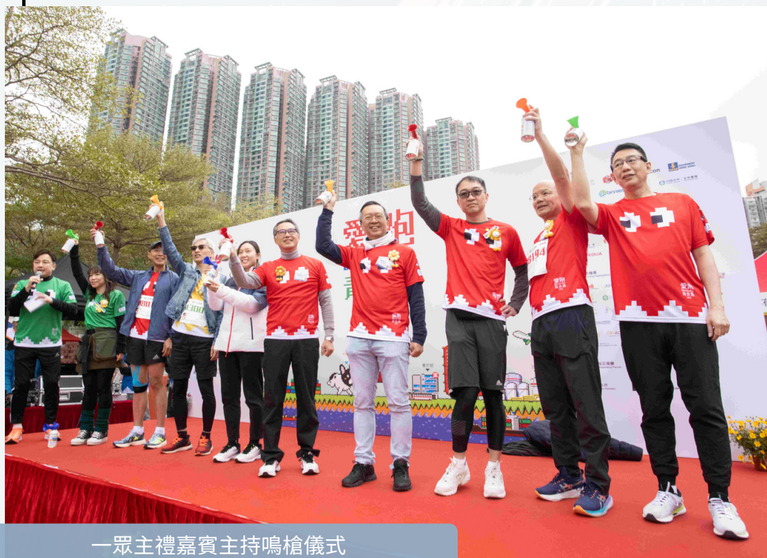
一眾主禮嘉賓主持鳴槍儀式 Guest of Honour started Lifewire Run 2023