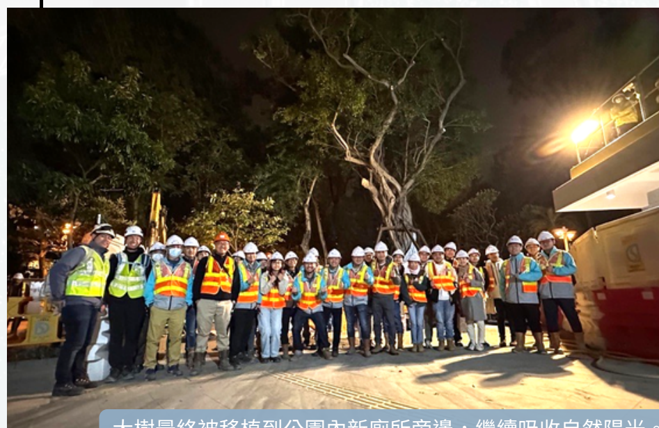
大樹最終被移植到公園內新廁所旁邊，繼續吸收自然陽光。 The tree was strategically relocated adjacent to the new restroom in the park to abundant natural sunlight.

團隊由清晨開始事前準備，而為了減低對市民及路面車輛的影響，團隊選擇於深夜進行運送程序，透過自走式模組化運輸車（SPMT）進行搬運，工程人員全程留意住大樹，最終於翌日日出前順利完成，並將漆咸道南路面原貌恢復，歷時接近24小時。