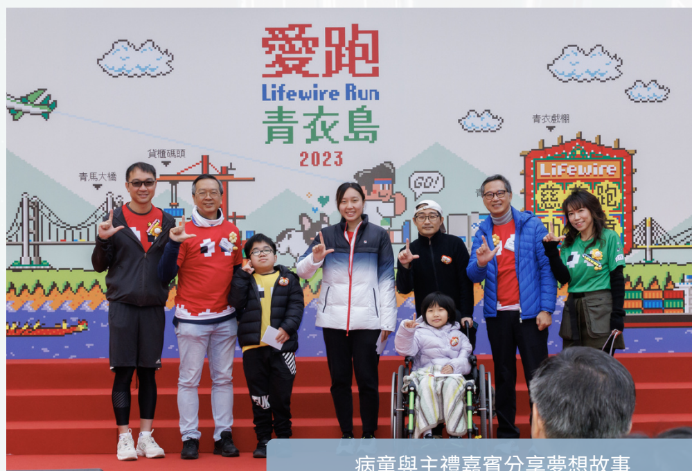
病童與主禮嘉賓分享夢想故事 Children talked about their dreams with the Officiating Guest.