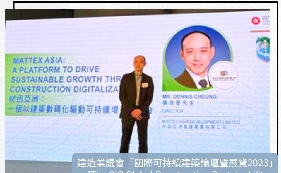
建造業議會「國際可持續建築論壇暨展覽2023」 "The CIC Global Construction Sustainability Forum and Exhibition 2023"

材迅亞洲善用集團豐富的施工專業知識，配合人工智能(AI)引擎，加強其物料呈交管理模組( Submission Management Module )，協助地盤同事撰寫文件，藉以提高效率。在IT部門的支援下，現已將近萬份施工方案數位化以培訓KMS AI引擎。地盤同事可利用AI技術草擬文件內容，以SMM獲得上級數碼簽署及提交有關文件予客戶審批。